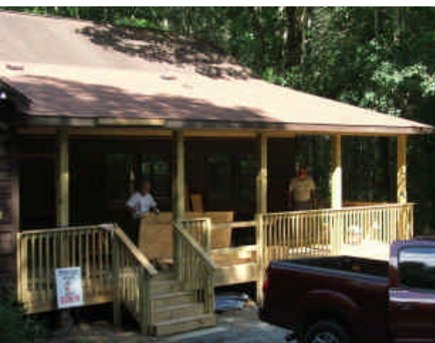
The porch at Tipton Lodge has already become a favorite gathering place even though it is not completely finished.

Hats off to Broadway United Methodist for providing the funds and volunteer workers for this project!